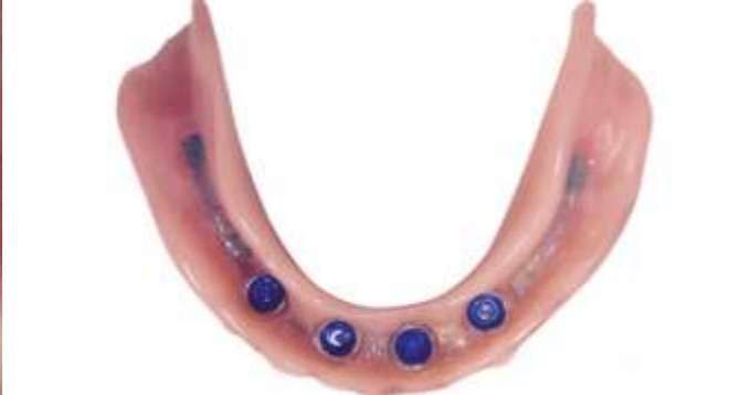
Locator abutments arranged in the upper jaw ready for the full denture to be attached