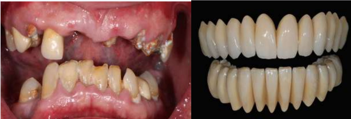
Broken down teeth with decay and advanced gum disease

Although many of our patients have suffered both the emotional and functional issues of total tooth loss for many years, they may not expect or require the immediate attachment of their teeth. Instead they wear their complete dentures as normal during a 90-day healing and integration phase. After this, treatment continues and we create an arch of replacement fixed teeth.