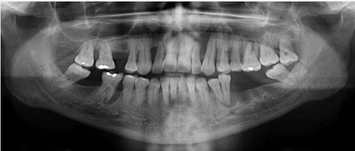
Full mouth x ray taken as part of the consultation process of teeth above